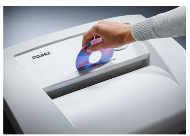
Separate CD feed opening with dedicated collection bin for environmentally friendly waste separation and secure destruction