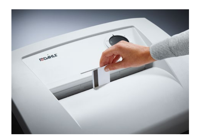
Reliably destroys cards