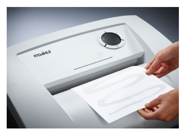
Dahle Waste 110 document shredder